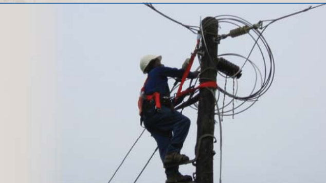
Electrification targets have been exceeded.

The foundation provides support to economic and social projects through grants and donations, targeting communities where we implement our new build programme and the communities in which we operate.